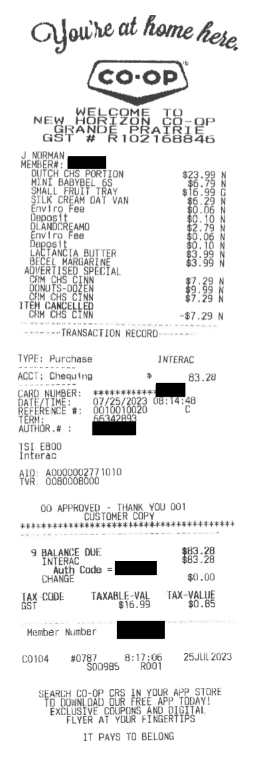
I hereby certify that the whole of the expenditure was incurred and that amounts claimed have not previously been paid to my staff or on their behalf.